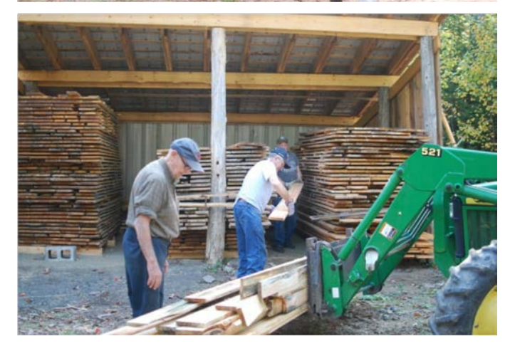
Salvage timber harvest of trees that blew down in October 2017 windstorm. Tuesday Crew worked with students from Brewer High School and built storage shed for lumber. Lumber was used for several museum new buildings.