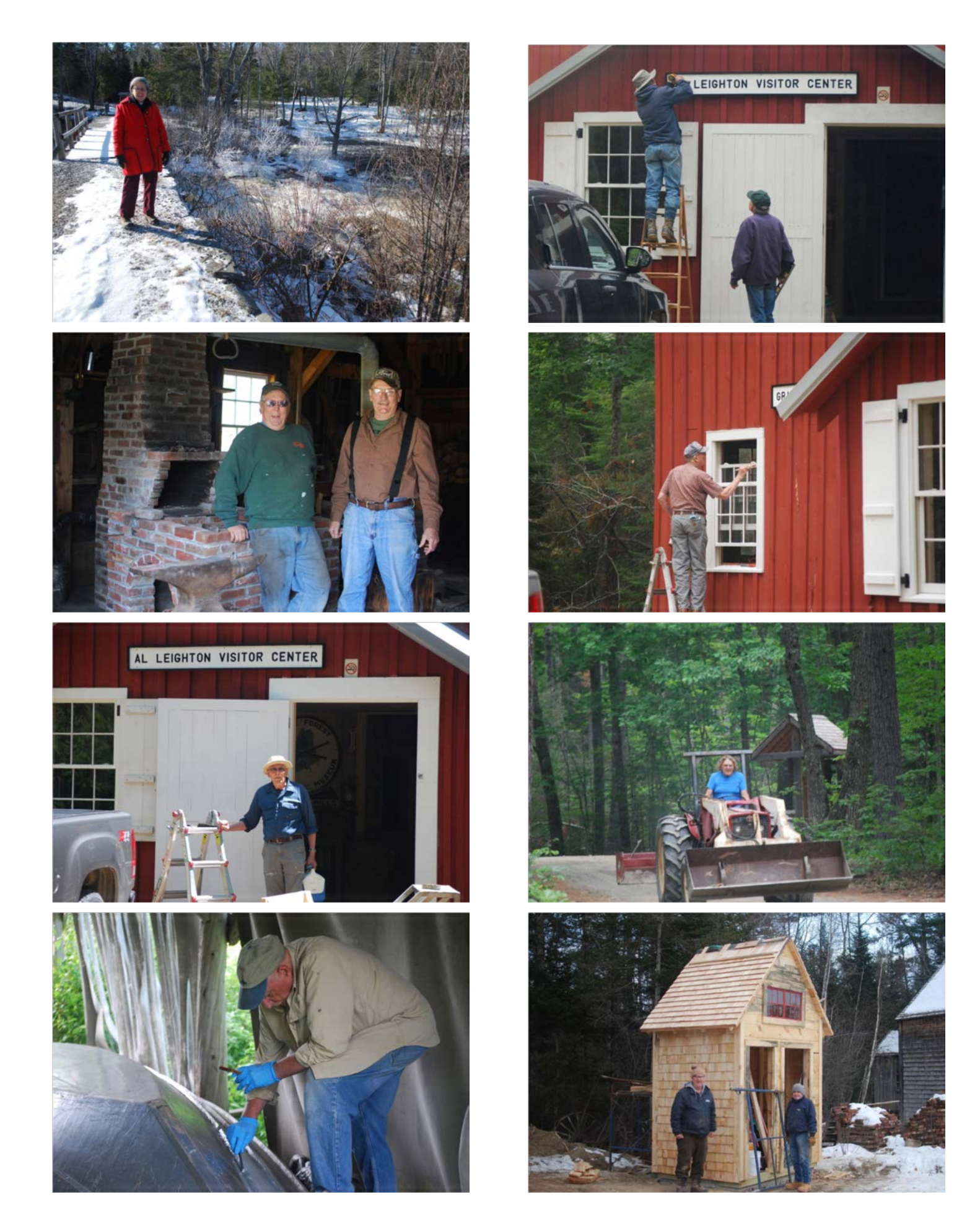
Tuesday crew building new forge, museum signs, ADA accessible privy, repairing batteau, and maintaining grounds.