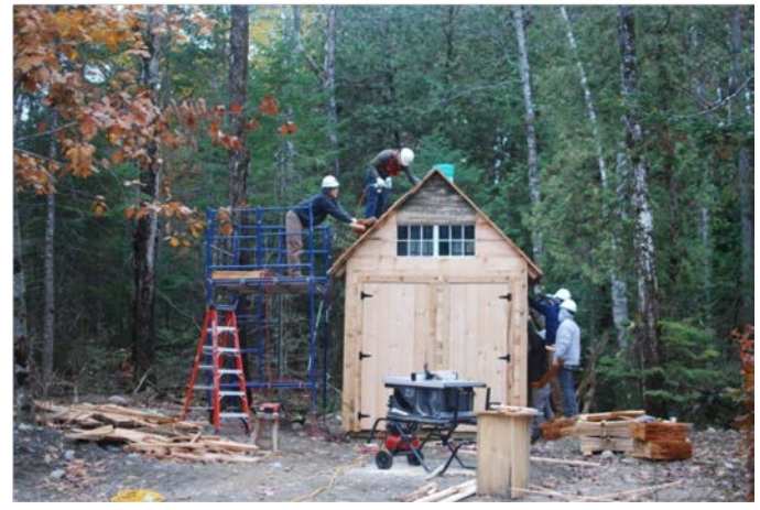
University of Maine Construction Engineering Technology students replaced the roof on the hovel and built 2 new ADA accessible tank privies. New England School of Communications students made 2 professional movies of our museum.