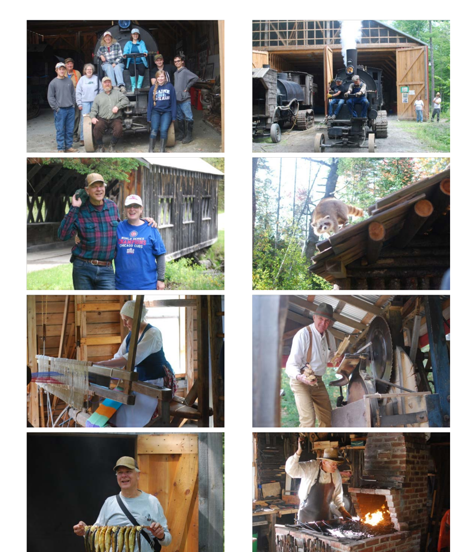
Volunteers helping with On The Run event in June. Trapper's cabin was rebuilt by the Maine Trapper's Association.