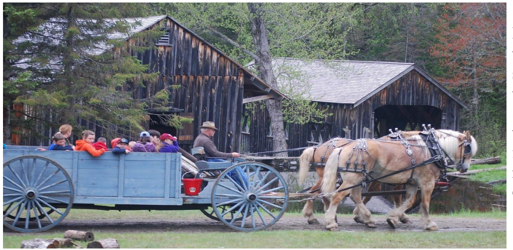
Event season started with the alewife run-some smoked--, school tours and Children's Days. So many volunteers help with crafts, games, dipping fish, demonstrations and more, they make learning exciting.